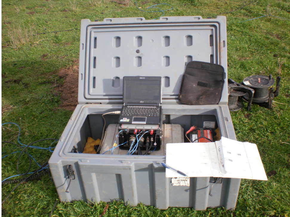
Plate 1: MT recording unit

As the survey crew were constantly busy installing and uplifting stations not many photos were taken for this part of the survey. Location: Cressy, Connorville. More images are contained on the CD inclusion.