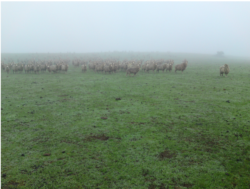
Plate 2: Site before any digging took place.